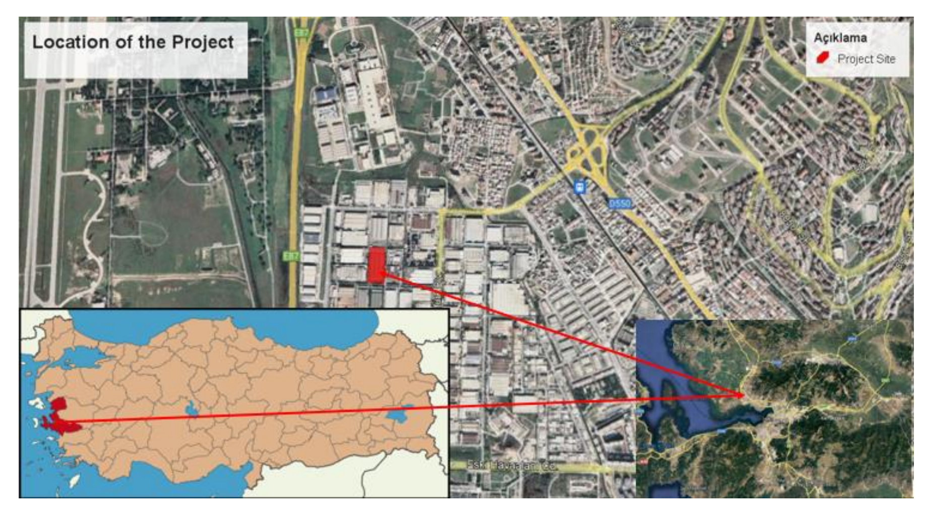
Figure 1-1 Site Location Map of Atik Metal (Çiğli Branch)