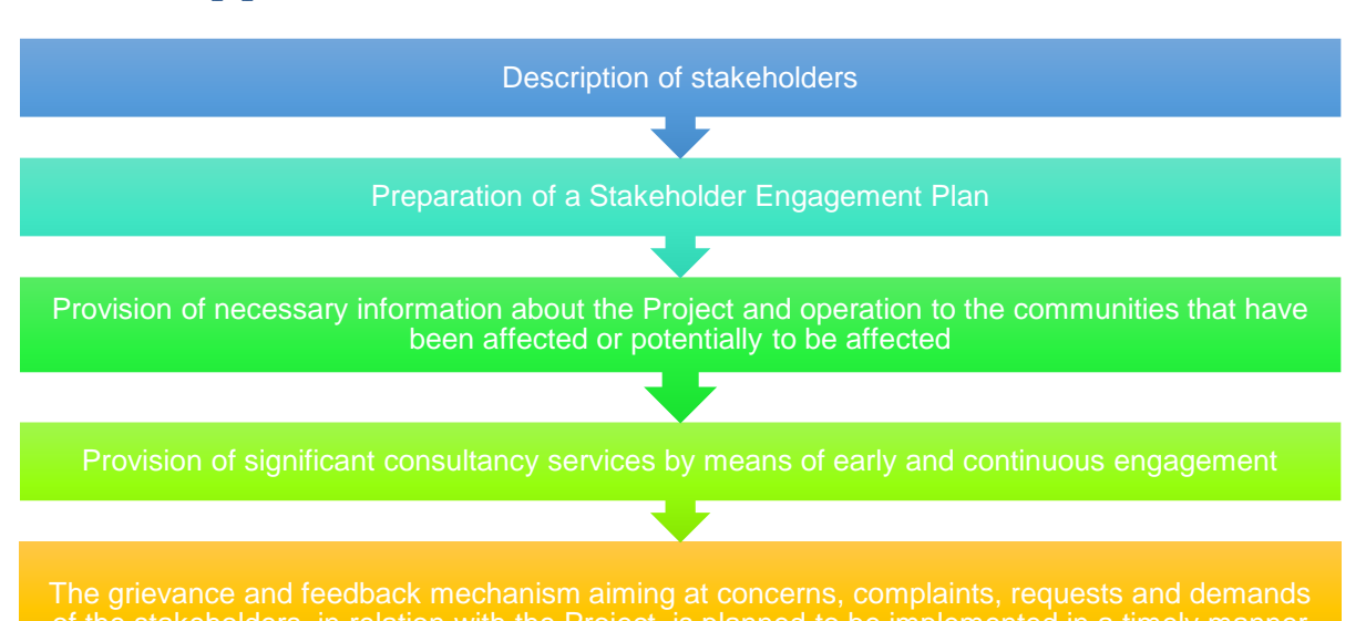
Figure 3-1. Main Requirements of International Standards and Guidelines regarding Stakeholder Engagement